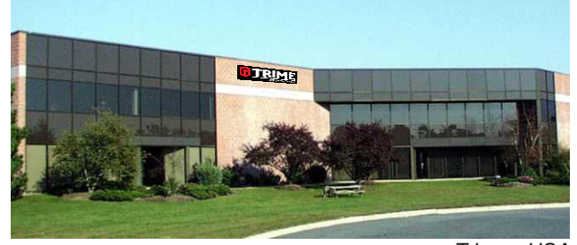
Trime - Italy